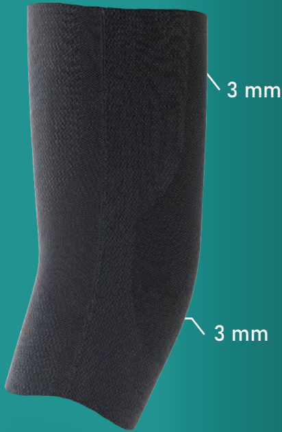
3 MM UNIFORM